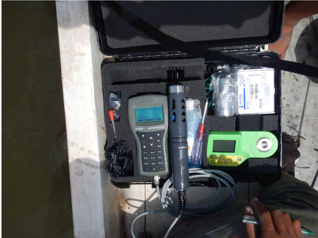
Lampiran 3. Gambar multi parameter